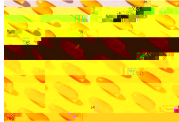
National Endometriosis Awareness Month Multiple Sclerosis and Its Effects on the Mouth and Eyes