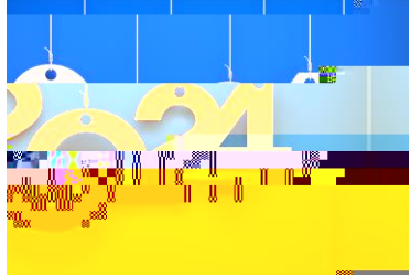
Dental Health Resolutions Birth Defects and the Oral Connection Maintaining Dental Hygiene while in the Office